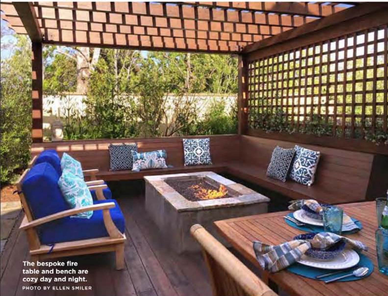
The bespoke fire table and bench are cozy day and night.